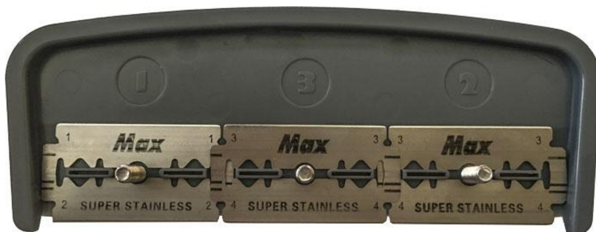
Figure 1. Razors in cover