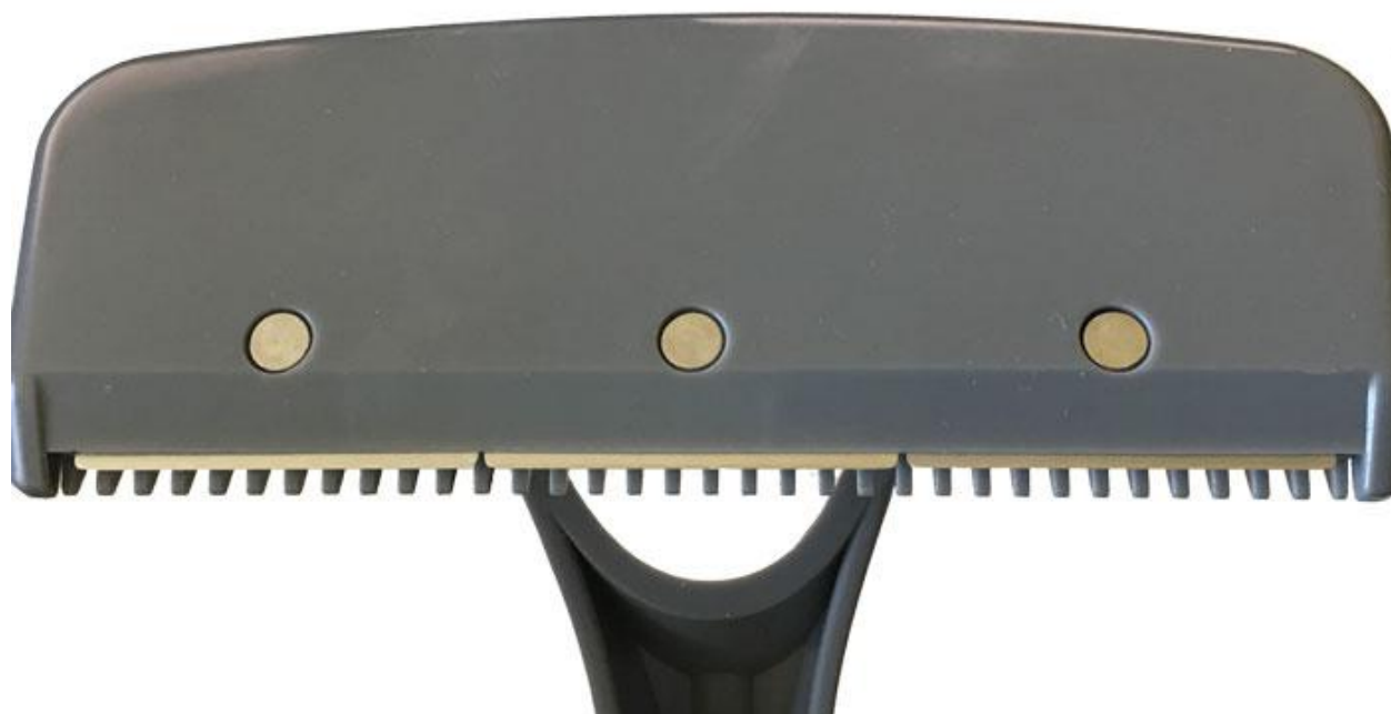
Figure 3. Loaded Bro Shaver