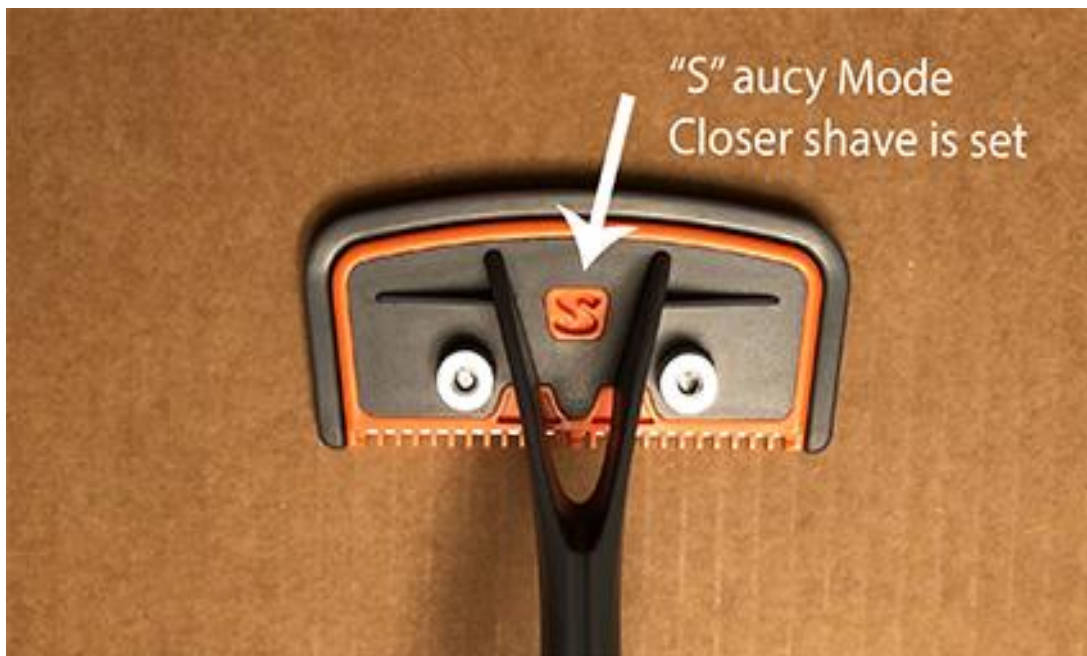
Figure 3. Saucy shave setting selected.