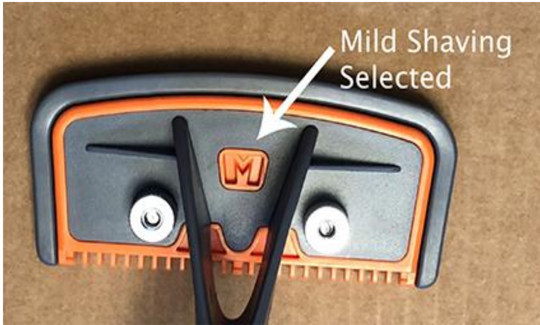
Figure 2. Mild shave setting selected