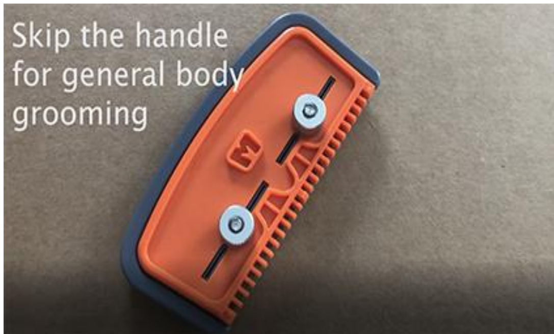
Figure 4. Use without handle for general body grooming.