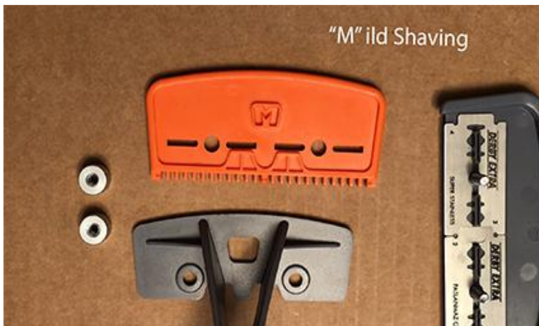
Figure 1. Assembling